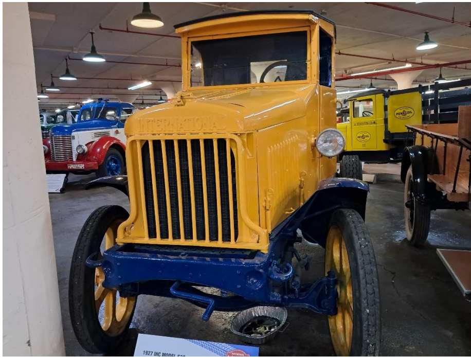
1927 International Model 63C with optional chain drive. Displayed at NATMUS in Auburn, IN.