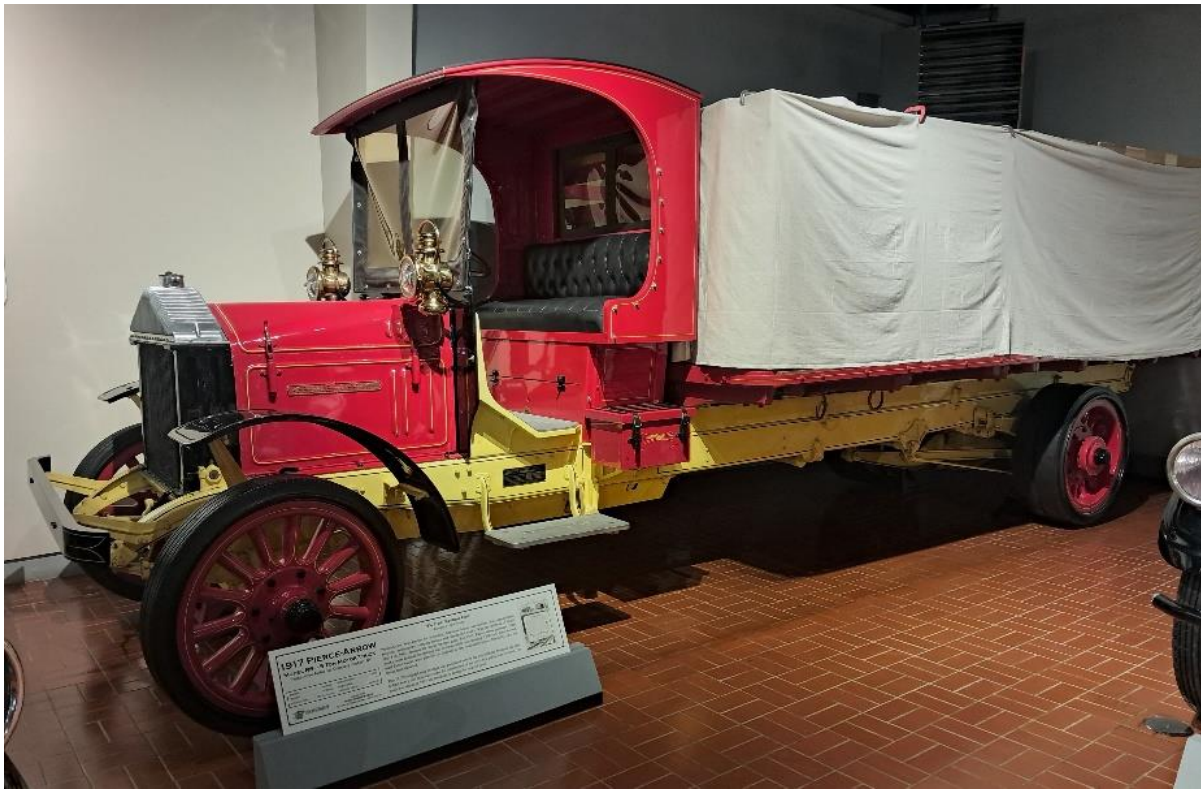
1917 Pierce- Arrow Model R8 5 Ton Motor Truck – one of approximately 7000 trucks (all models) built by Pierce-Arrow. Located in the Pierce-Arrow Museum at the Gilmore Museum complex, Hickory Corners, MI.

Old truck heaven – photos from your editors’ recent trip to Michigan.