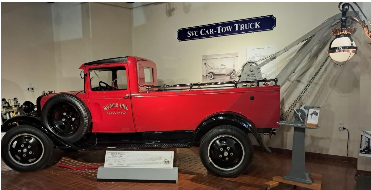
1930 Ford Model AA Service Car/ Wrecker - with Briggs slab side body and Weaver 3-ton mechanical hoist. One of 521 built for local garages, service stations and Ford dealerships and sold equipped for $790.00. Located in the Model A Museum at the Gilmore Museum complex, Hickory Corners, MI.