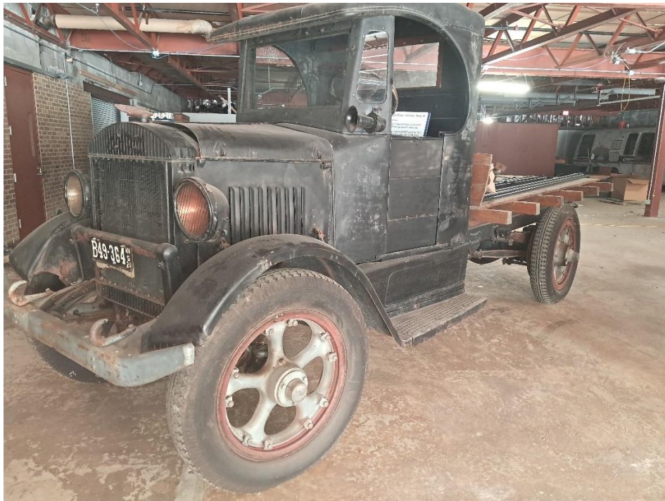
1926 GMC K-41 2 ½ ton truck. Stored behind the scenes at the recently opened Pontiac Transportation Museum, in Pontiac, MI. The K-41 was also offered as a tractor (K-41T) which was rated at 5 tons.