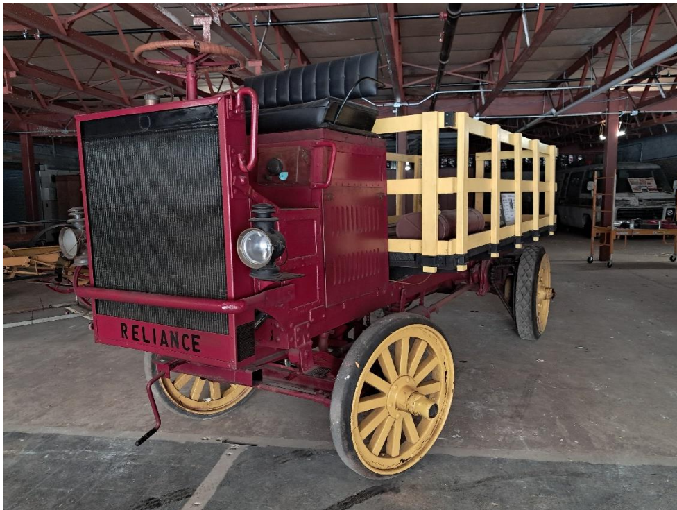
1910 Reliance Motor Truck - Reliance was started in 1904 in Detroit and moved to Owosso in 1908/09. GMC bought Reliance in 1910 and rebadged the trucks GMC in 1912. One of two Reliance badged trucks known to exist this truck is in storage at the Pontiac Transportation Museum in Pontiac, MI.